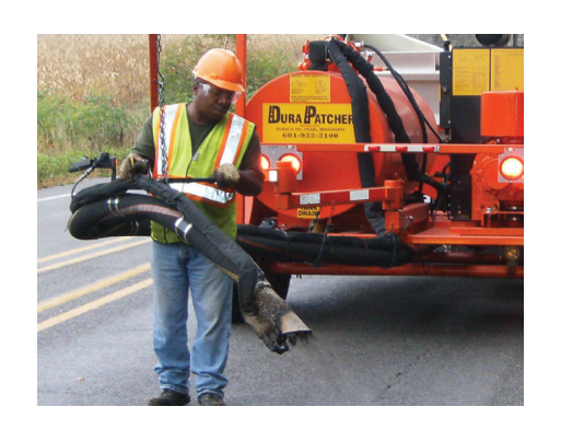
Ergonomic No Stress Boom