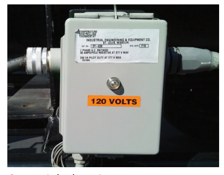
Over night heating system