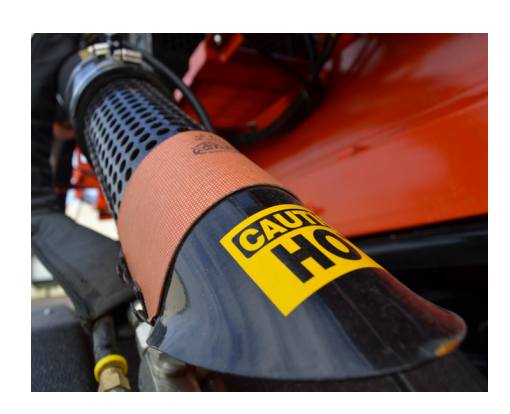
Vent-Flo Nozzle with optional heater